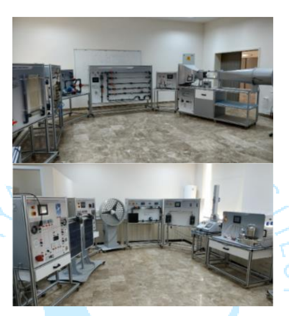
Thermodynamics and Energy Laboratories