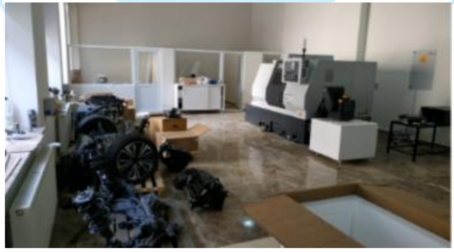
CNC (Mechanical Workshop)